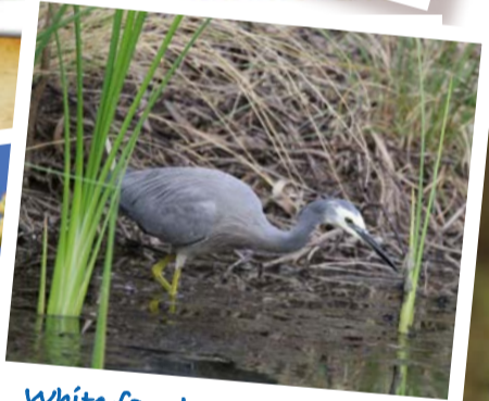
White faced Heron