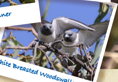
White Breasted Woodswallow