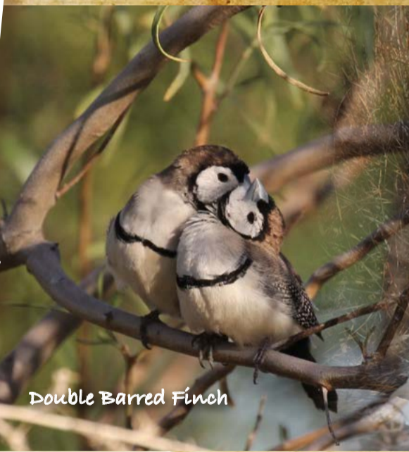
Double Barred Finch